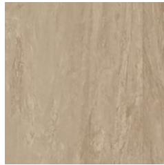
Mushroom 9110 w/r 9110 NCS S 3010-Y30R LRV 40 ■ +