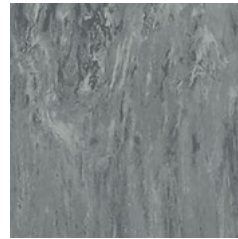
Graphite 9120 w/r 9120 NCS S 4502-G LRV 28 || ■ +