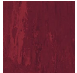
Black Cherry 8580 w/r 8580 NCS S 5030-R LRV 9