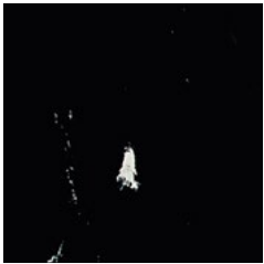
Black Panther 8640 w/r 8640 NCS S 8502-R LRV 6