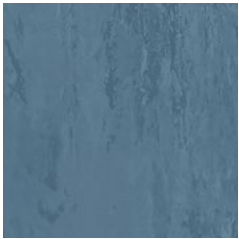
Atlantic Blue 9170 w/r 9170 NCS S 4020-R90B LRV 23